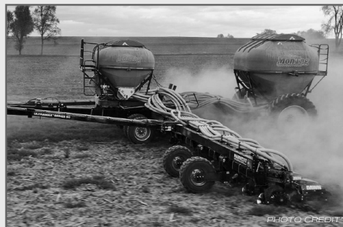
ST60 ULTRAMAX 24 ROW PULLING PLURIBUS STRIPTILL ROW UNITS