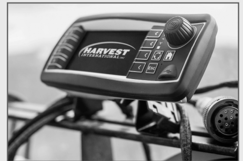
TOOLBAR FUNCTION CONTROL CONSOLE; CAN BUSS OPERATED