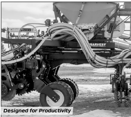
Designed for Productivity