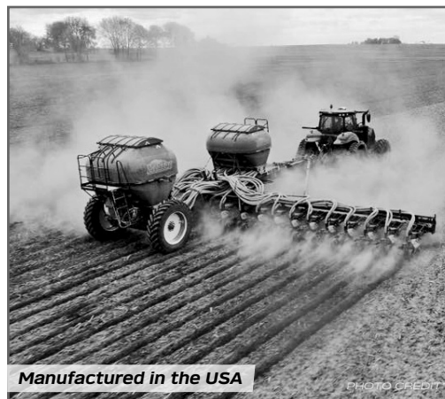
Manufactured in the USA